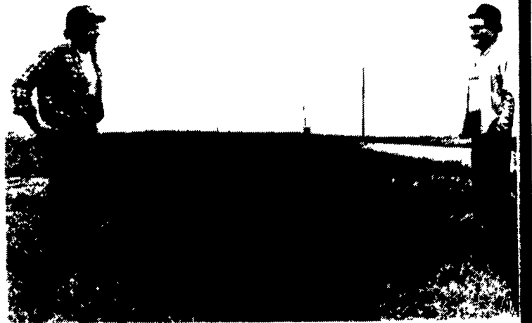
Father and son pose along one of the grass buffer strips that keeps Statler soil on the Statler farm.