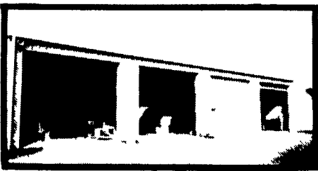
SHOP - STORAGE - GARAGE