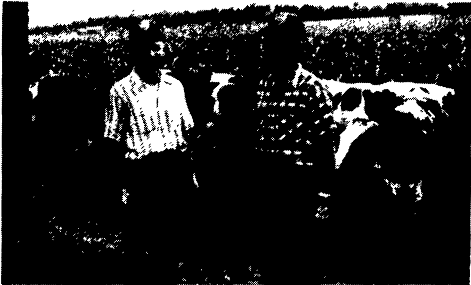
"Hardy weighs up better... really comes through on poorer soil."