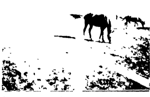
The Arc 12 Solar system allows us to safely run our stallions next to the mares eliminating time and labor on try backs