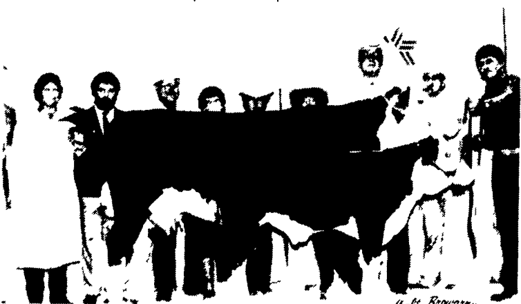
SBF Royal Gypsy and her bull calf took reserve grand honors at Toronto's International Hereford Show.

Gypsy is actively in an embryo transplant program at Spring Bottom Farms, where she was born and raised.