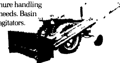
Revolutionary Equalizer is specially-designed to efficiently and easily load semi-solid manure.

a full line of support equipment for your semi-solid and liquid manure handling needs. Basin agitators.