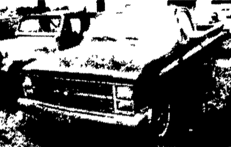
'83 Chevy Scottsdale, V8, Auto., PS, PB, AM/FM, Aux. Fuel, 28,000 Miles $7,950