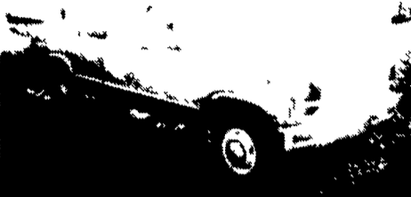
'83 Ford F250 Super Cab, 351, AT, PS, PB, AM/FM Cassette, Reclining Bucket Seats, 2 Tone, Excellent Condition $9,500