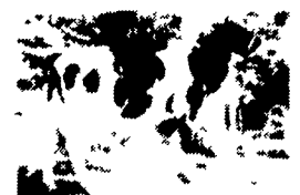
Dam Walker Farm Chief MS 5 09 2x 305d 24590M 3 9 94RF