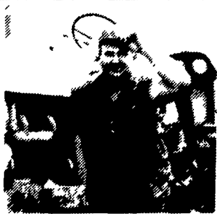
"as the name goes, it's Hardy"