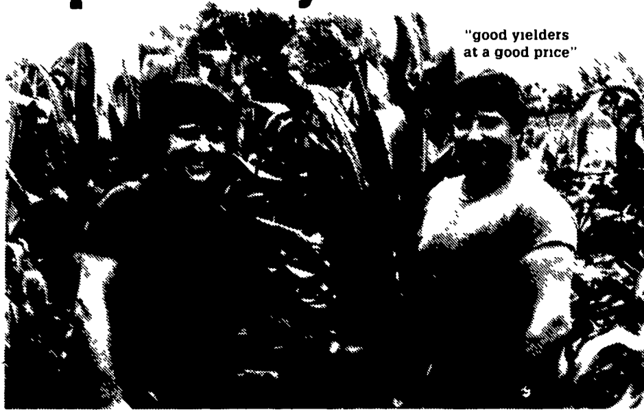
"good yielders at a good price"