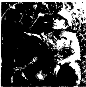
"good yields and fast drydown"

Hardy Brand Hybrid Corns have been scientifically bred for the Northeastern United States. They have proven their potential for high yields, superior standability and high tolerance to predominant disease on farms throughout our market area. Many of our customers have been using Hardy Brand for years for reasons like the ones above.