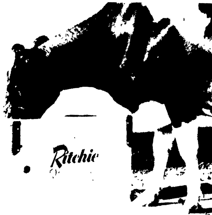
Challenger™ Livestock Fountain manufactured by Ritchie® Livestock Fountains.

The Challenger can easily replace existing cattle fountains, according to Peterson. "It is easy for Ritchie dealers to make this exchange because it doesn't require any special water supply tile," he says.