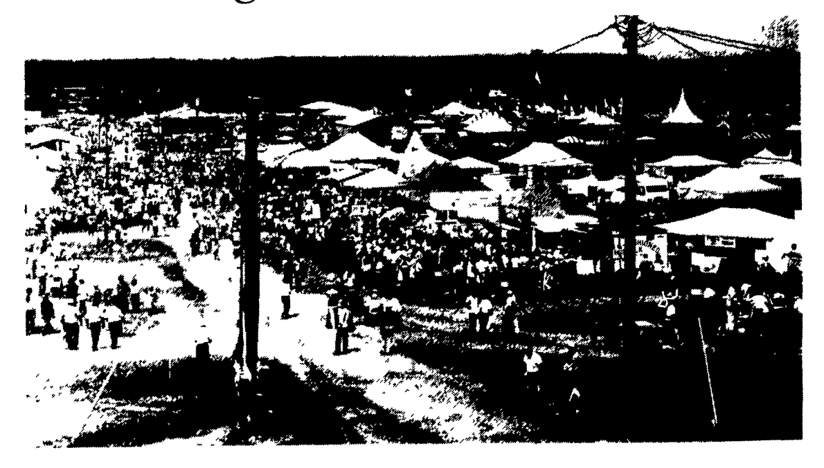
Crowds surround the food stands at lunchtime on Wednesday.

ROCK SPRINGS — Penn State's Ag Progress Days met the expectations of young and old, producer and consumer, dairyman and vegetable farmer.