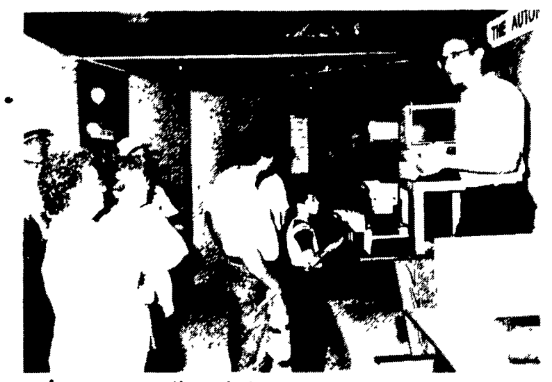
A group moves through the first of three stages of an eightminute presentation on the new computer system that links

The view from outside the new building, where the computers were on display.