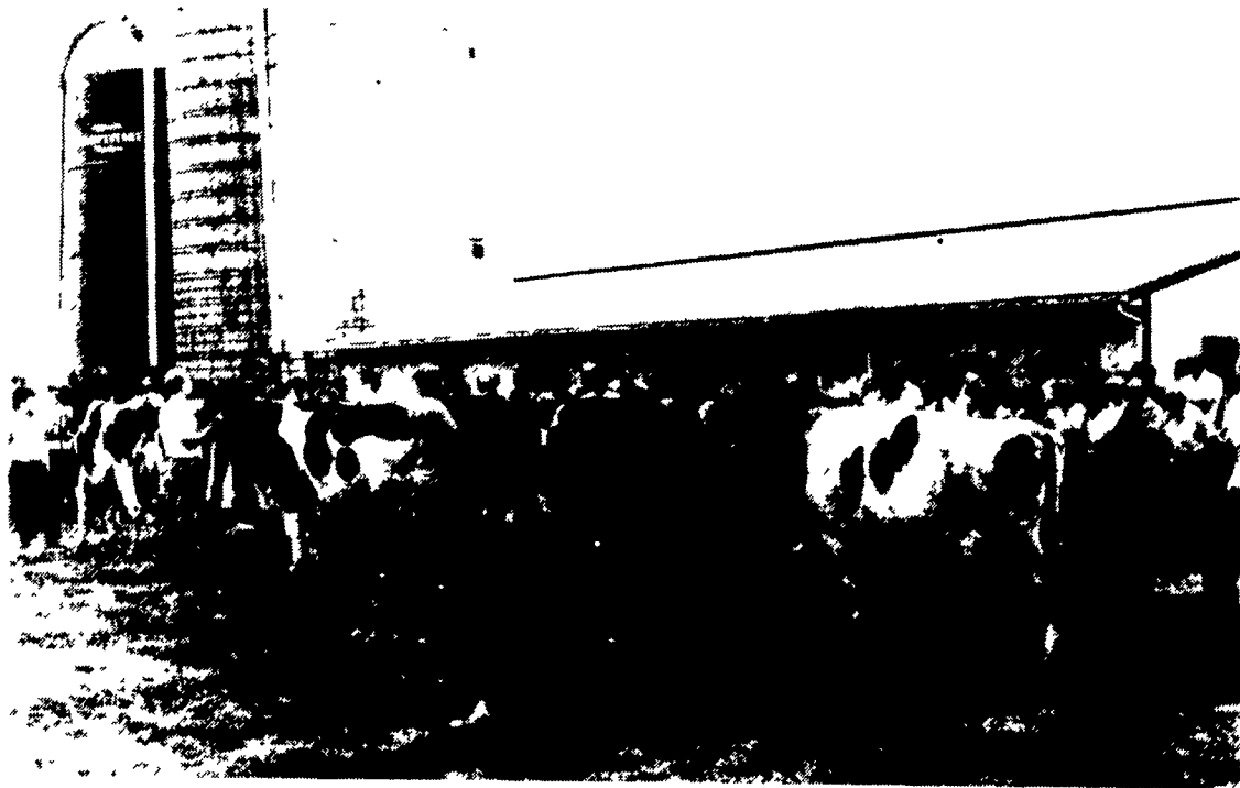
A judging contest highlighted events at the recent Butler County Holstein twilight meeting.