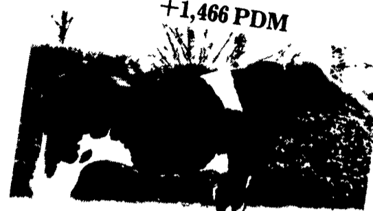
15H416 Blair-BR Carmel Pepper