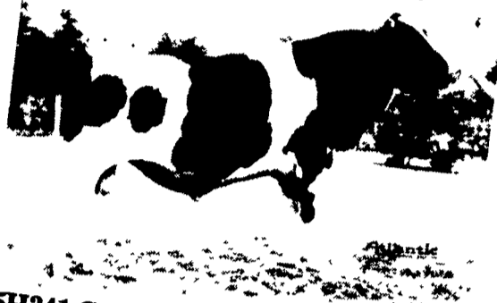
15H341 Crescentmead Chief Stewart