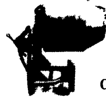
SITREX 3 pt. CEMENT MIXERS