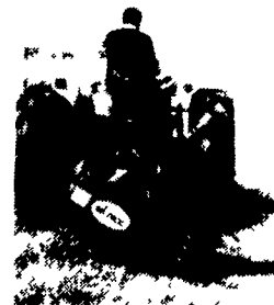
DYNA BALANCE SITREX 6' SICKLE MOWER $1695

Reproduction of Massey-Ferguson 35, Most Parts Interchangeable