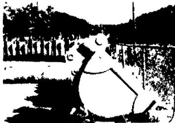
KING KUTTER DISC'S