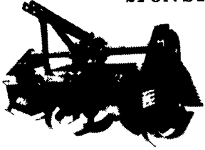
SITREX 3 pt. Roto-Tillers w/P.T.O.