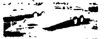
HUDSON 9500 GVW TRAILERS

All Wheel Brakes, Ramps 14' Bed $1595 16' Bed $1695