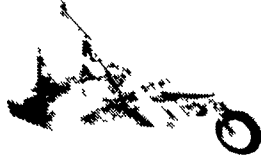
KING KUTTER ROTARY MOWERS