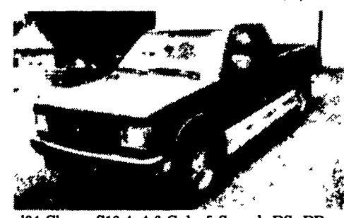
'84 Chevy S10 4x4 6 Cyl., 5 Speed, PS, PB, AC, AM/FM Stereo, Tilt Wheel, 14,000 Miles $10,800