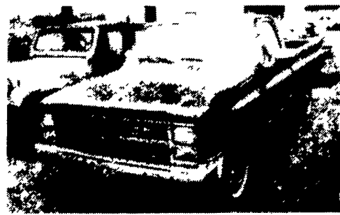
'83 Chevy Scottsdale, V8, Auto., PS, PB, AM/FM, Aux. Fuel, 28,000 Miles $7,950