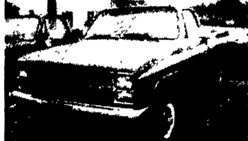
'84 Chevy. 3/4 Ton, 4x4, 8600 GVW, V8, Auto, PS, PB, AM/FM Cassette, 25,000 Miles $10,500