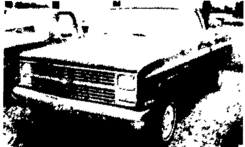
'83 Chevy 1/2 Ton 4x4, V8, PS, PB, Auto. Overdrive, Aux. Fuel, AM/FM Cassette Player, 36,000 Miles $8,850