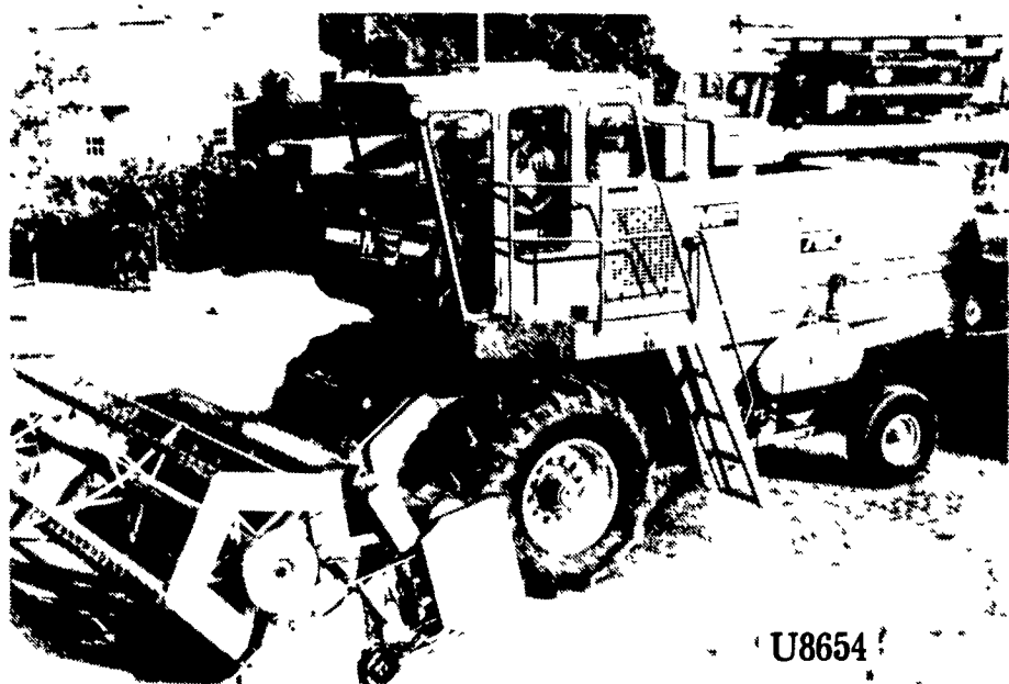
U8654 - MF 750D HYDRO Combine, A/C, 23.1x30 Tires & 15' Platform