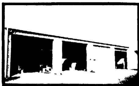
SHOP - STORAGE - GARAGE