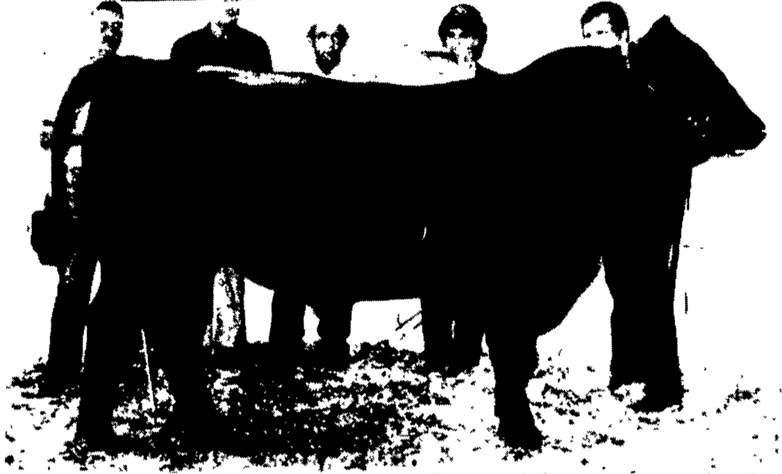
Genetics Proton, a Progression son, was the Angus Breeders Show's top bull. He is owned by Genetics Unlimited and Stewart and Sons of West Grove.