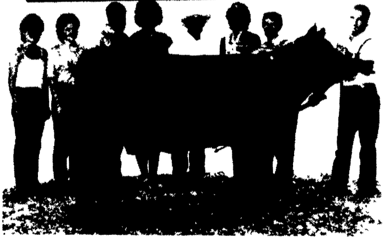
GH2 Angus Associates, York, campaigned the show's number-two female, R&J Lucy 184.