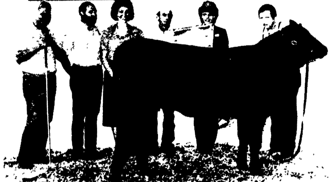
Grand champion female at the Angus Breeders Show was this Greenbrae Chairman daughter, Primrose Charm 7584, owned by Genetics Unlimited, Riverside Farm and Ten Angus of West Grove.