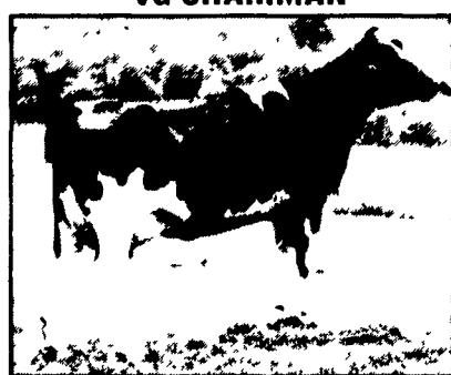
ARROW GWEN, VG(85) 3 6% 111d 6813m Dam is GP(83) with 22 150m 850f Gr Dam is GP(83) with 20 517m 771f Consignor Ben Hallock Laceyville PA