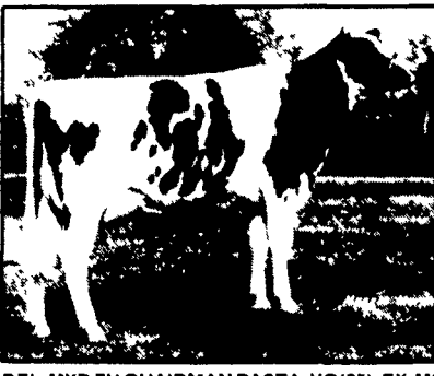
DEL-MYR FH CHAIRMAN PASTA, VG(85), EX-MS 12 670m 3 5% Dam is GP(83) Bell daughter with 26 210m 940f