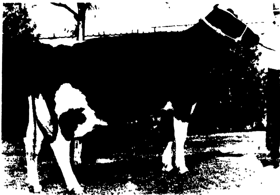
A VALIANT DAUGHTER JONGSMA GRADE #649