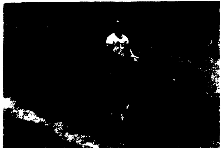
Tom preferred the more traditional method, "because you didn't have to watch where you were going."