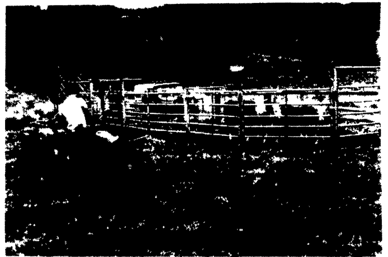
Though minibikes were available for driving cattle...

He's also hoping that the future holds a second chance to experience more firsts in "the land down under".