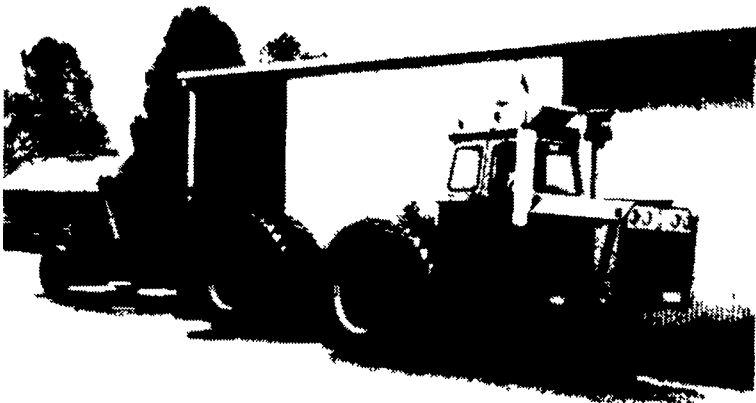
Featuring a truck engine and differentials and a homemade cab, this tractor was built from the ground up by the Pietsch family.

horse," he grins, noting that, in addition to rounding up sale animals, small herds were brought in every couple of weeks for worming.