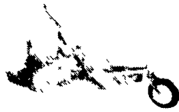
KING KUTTER ROTARY MOWERS