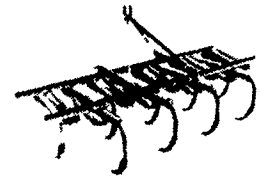
9 TINE CHISEL PLOWS $495