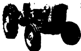
BRAND NEW IMT 539 DELUXE 39 H.P.

Reproduction of Massey-Ferguson 35, Parts Interchangeable