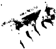
KING KUTTER LANDSCAPE BOX