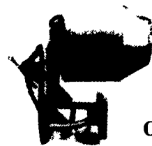
SITREX 3 pt. CEMENT MIXERS