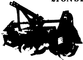
SITREX 3 pt. Roto-Tillers w/P.T.O.