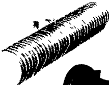
KING KUTTER STONE RAKES 6'...$495 7'...$550 8'...$595