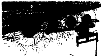
SITREX 3 pt. HAYRAKES (and TEDDERS) $495