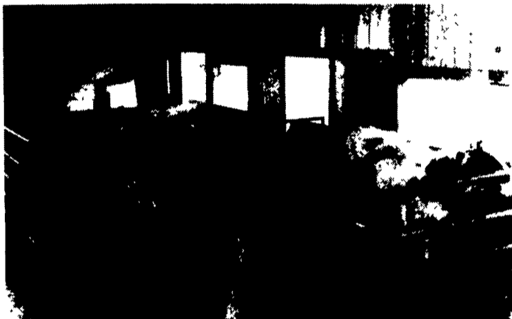
Box stalls in the dry cow area are 12 x 12 and lined along the wall with treated lumber.

Individual cow care, geared toward high production, has long been standard at Richlawn, with a rolling herd average on 75 head of