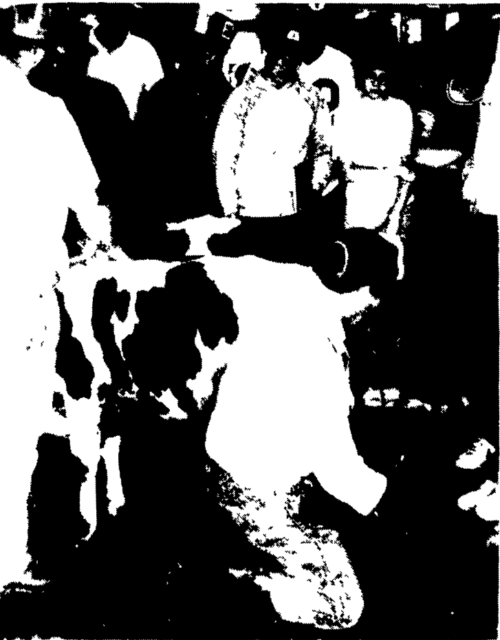
The second annual Ag Summer Weekend camp for teenagers is scheduled for July 12-14 at Alfred State Agricultural and Technical College. Here, students participate in one of last year's lab sessions.

U.S. winter wheat production is forecast at 1.97 billion bushels, four percent less than last year's production of 2.06 billion bushels. Total 1984 U.S. tobacco production was 1.73 billion pounds, 21 percent above 1983 production. All hay stocks on farms as of May 1 totaled 26.86 million tons, 33 percent above that stored on May 1, 1984.