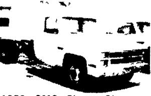
1983 GMC Sierra Classic, Dual Wheel Cab & Chassis, 454 4 Speed, PS, PB, Air, 10,000 GVW '8,950