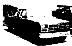
1984 Ford F150 Super Cab Pickup, 300 6-Cyl, 3 Speed, PS, PB, 17,000 Miles '8,250