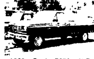
1983 Ford F250 1/2-Ton Pickup 300 6 Cyl, HD 4-Speed, PS, PB, 29,000 Miles '7,400