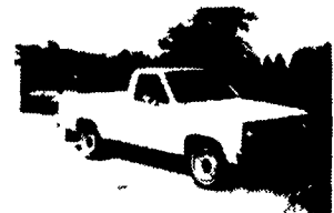
1983 Ford Ranger Diesel Long Bed 4-Speed, PS, PB, Sliding Rear Window, Tu Tone Blue & White, 25,000 Miles, Ex. Cond. '5,250