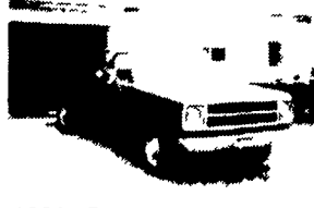
1980 Dodge D200 3/4-Ton Club Cab Pickup, 360 4-Speed PS, PB, Dual Tanks, 8500 GVW Trailering Package '4,450