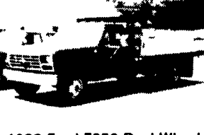
1983 Ford F350 Dual Wheel, 12 Ft Flat Bed, 351 4-Speed, PS, PB, Dual Tanks '8,950