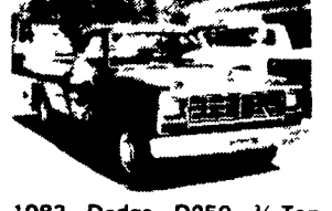
1983 Dodge D250 1/2-Ton Pickup 6 Cyl, HD, 4 Speed, PS, PB, Air, AM-FM, Ex Cond '6,950