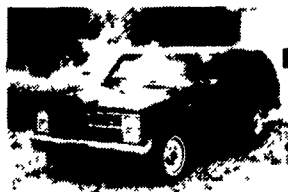
83 Chevy Scottsdale Suburban 6 Pass., 305 Auto., PS, PB, Air, AM/FM Cass. Stereo, 34,000 Miles, Dark Brown '8,950