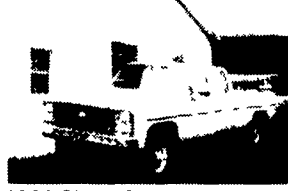
1980 Chevy Scottsdale C30 4 Wheel Drive Crew Cab, 350 Auto, PS, PB, AM-FM Dual Tanks, 40,000 Local 1 Owner '9,200