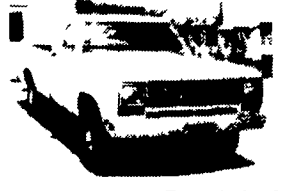
1984 Dodge 1/2-Ton 4x4, 6 Cyl., HD, 4-Speed, PS, PB, Radial Tires, 8,000 Miles '8,250