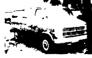
1983 Chevy Sport Van, 12 Pass., 350 Auto., PS, PB, 34,000 Miles, Ex. Cond. '8,950