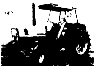
Deutz DX 4.70

90 HP Turbo Diesel, 19.6 GPM Hyd Pump, 15 Speed All-Synchro Trans, 540/1000 PTO, F Weights Unit #225