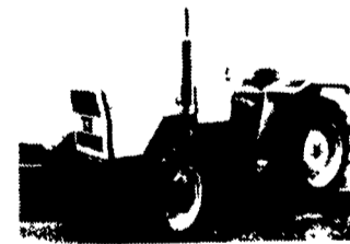
Landini DT 5830

42 HP Perkins Diesel, 12 Speed Synchro Trans, Full FWD, 4 Disc Wet-Type Brakes, 4 Wheel Brakes, Big Front Tires Unit #233