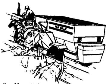
Trailer Mounted Mixer/Feeder