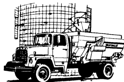
Truck Mounted Mixer/Feeder