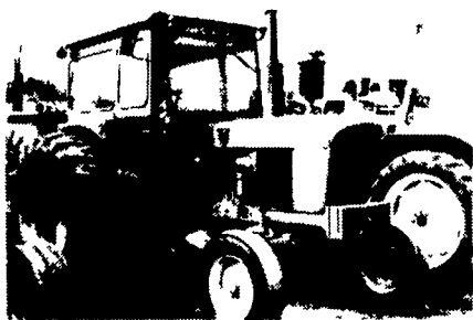
JD 4020, 1968, DIFF Lock, 2 Valves, Super Sharp, 4400 Hours ONLY $9,700