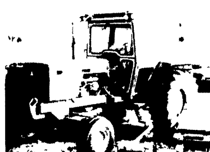
AC 185 Cab, Air, 1978 2200 Hours, Sharp ONLY $9,900