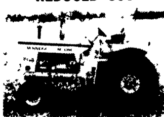
MM G1000 Vista, Sharp, Low Hrs., Bad Reverse ONLY $5,500