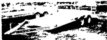
NEW 1985 TRAILERS ON SPECIAL • 2 Axle, 4 Ton, 14 Ft. $1595