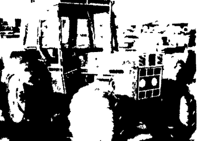
IH 784, 4WD, Cab, 1979 $10,500 IH 784, 4WD, Cab, 1978 $8,900