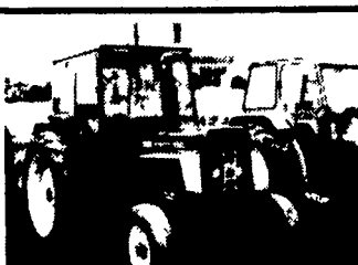
IH 574 Cab, 1975 Nice $6,500 (2) IH 574 Cab, 1977 Nice $6,700 & $6,900