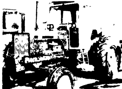
AC 200, Sharp w/Cab $8,500