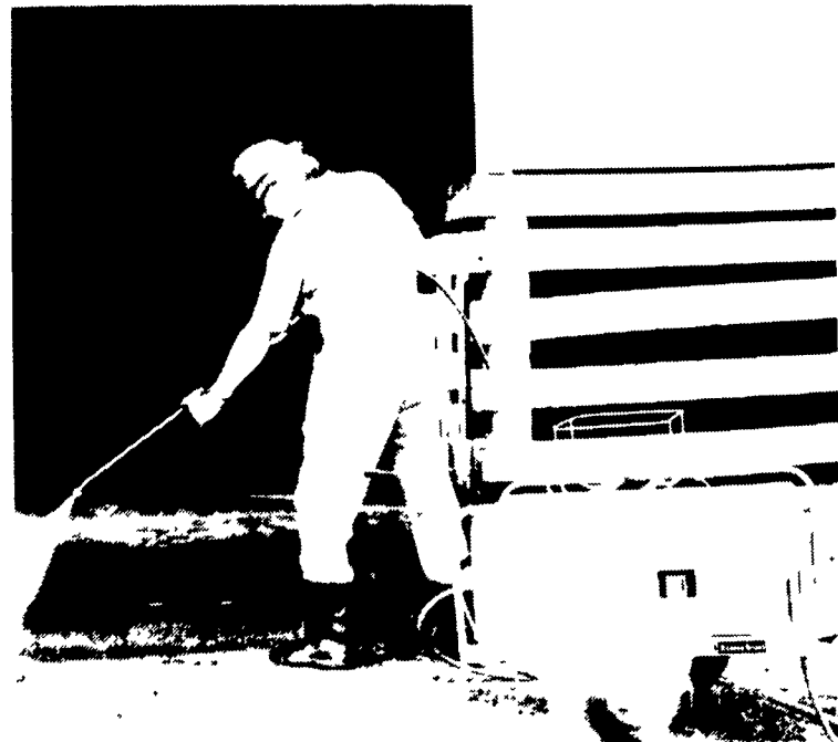
Euroclean's new E-6 pressure washer is especially adapted for cleaning hog pens.

The E-6 is available in 220v/1 ph, 220v/3 ph, and 440v/3 ph models and is in the latest addition to Euroclean's full line of pressure washers.