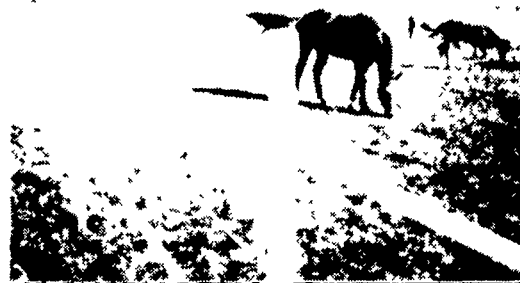
"The Arc 12 Solar system allows us to safely run our stallions next to the mares eliminating time and labor on try backs Harold S. Warder, Quality Quarter Horses, Okaloosa, Iowa

NUMBER 1 CHOICE OF NEW FENCING BY AMERICAN FARM & RANCH OWNERS