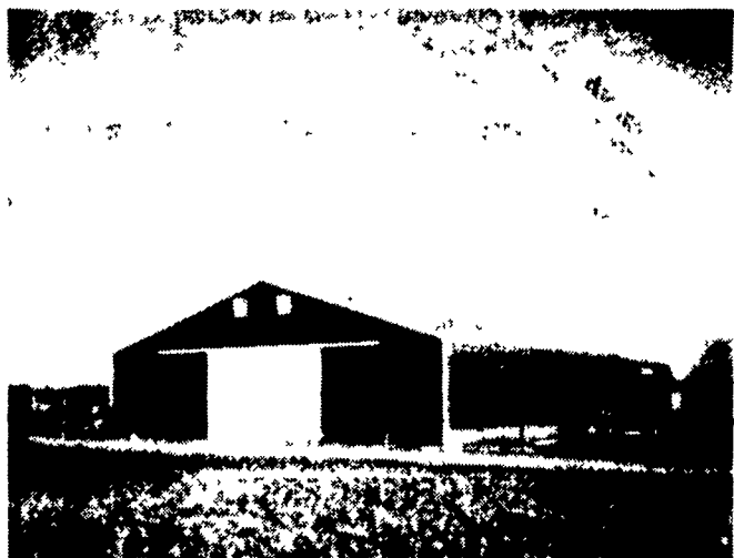
Machinery & Hay Storage Building

Let Our Experience Work For You In 1985 For All Your Farm Building Needs, Large Or Small