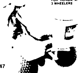
MODEL GT-77 NOW WITH MOUNTING BRACKETS FOR HONDA ATCS AND OTHER 3 WHEELERS