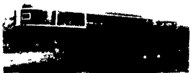
(1) Dion Forage Wagon