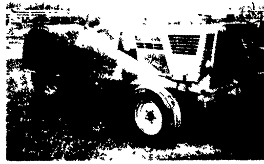
DEUTZ 6806 Orchard Special $4900