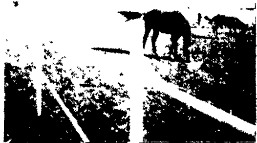
"The Arc 12 Solar system allows us to safely run our stallions next to the mares eliminating time and labor on try backs."