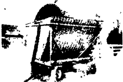
Dump Chief 700 Dump Wagon 12Lx15 Tires Used Very Little, Very Nice $4,450