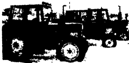
1979 IH 784 4 WD - 2500 Hours $10,900