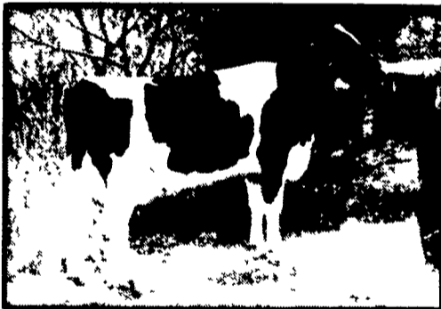
DAM GP 82 STANDOUT JOB 365D 20,091 3.6 732F

*25 Cows with records over 20,000* *Herd Milking 52.9 daily with a 4.2 Test*