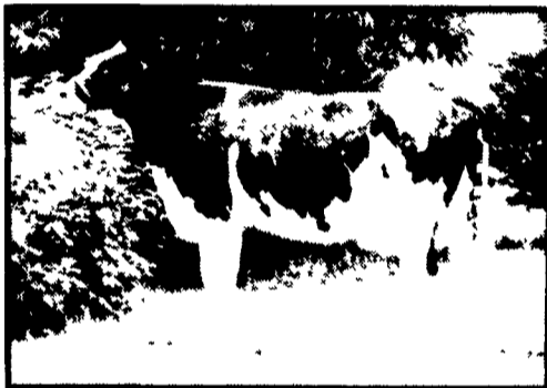
2nd DAM EX90 ELEVATION 359D 22,324 4.1 934F