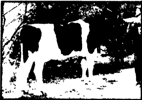
DAM VG 85 STANDOUT JOB 360D 23431 4.2 999F

A 3 yr. old Valiant (Never Scored but potential to High VG) 2-01 365D 17897 4.4 780F Due 4-1-85 to Roybrook Starlite