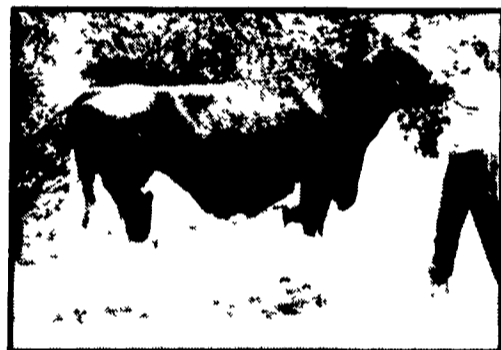
3rd DAM EX91 2E KINGSTEAD IVANHOE 365D 21167 4.1 872F Next Three Dams Are AU EX or VG with high records!

A 4 Yr old Jemini GP-80 Est. 305D 20,847 4.9 893F Milked 107.5 lbs. for tester