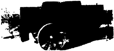
Smaller Improved Model 2 Sizes To Choose From

ALLIS CHALMERS AND WISCONSIN POWER UNITS COMPACT ROTO BEATERS