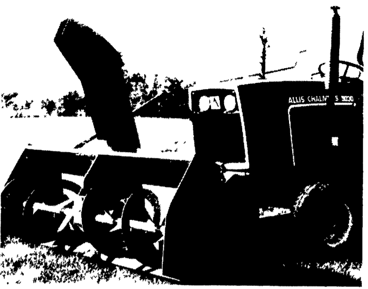
This 62-inch snowthrower is designed for the Allis-Chalmers 5020 and 5030 tractors.

MILWAUKEE, Wi. — A new 62-in. snowthrower designed for the 5020 and the 5030 tractors was recently introduced by Allis-Chalmers.