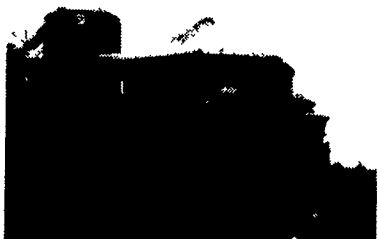
JD 4320 - Side Console - Dual Hyd. - 4200 Hrs.