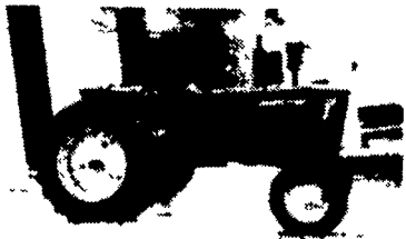
JD 4020 - 1750 Hrs. - Dual Hyd. - Diff Lock - Good Rubber - Solid