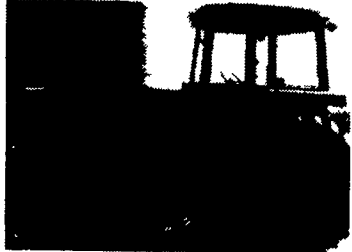
JD 4430 - Cab - QR - Wts - Exceptionally Sharp - 3300 Hrs.