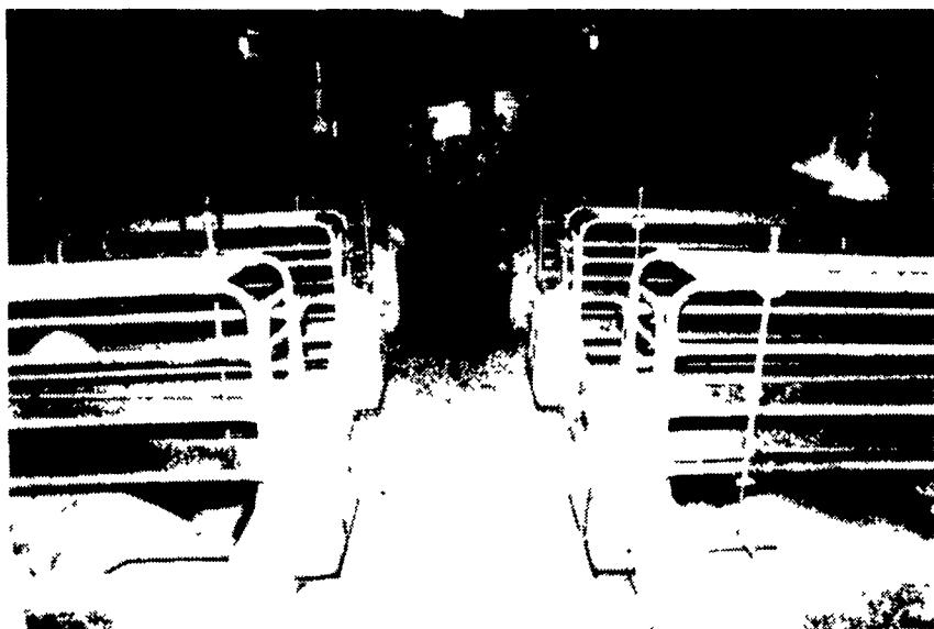
5 Farrowing Rooms With Woven Wire Flooring, Acme Ventilation w/Evaporative Cooling, Hot-Dipped Galvanized Crates, Heat Lamps On Automatic Dimmers.