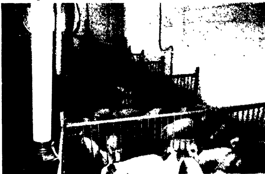
7 Nursery Rooms With Woven Wire Flooring, Acme And Fristamat Ventilation, Hot-Dipped Galvanized Penning, Cableveys Feed Delivery System.

FOR INFORMATION OR APPOINTMENT, CALL FARMER BOY AG (717) 866-7565