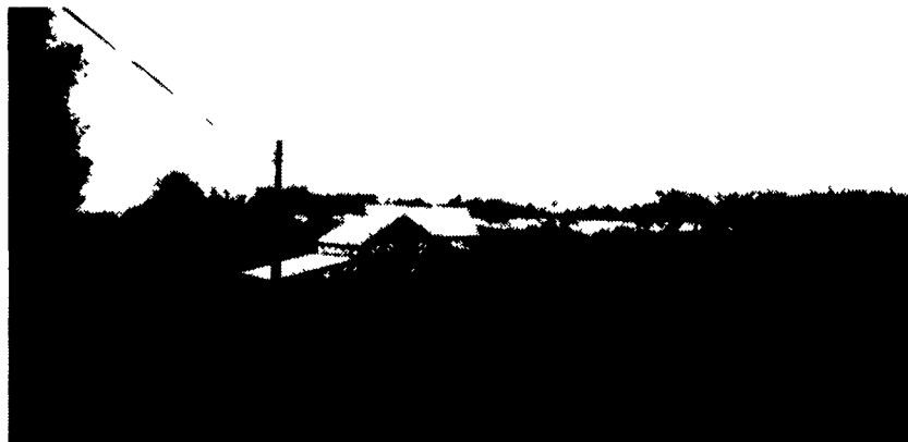
Bacon Acres Farm With Remodeled Gestation, Farrowing & Nursery In The Background

For Remodeling An Old Caged Laying Chicken House Into A New 250 Sow Farrow Thru Finishing Complex