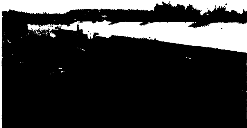
The Remodeled Building Adapted Well For Acme Ventilation And Lissco Manure Handling.