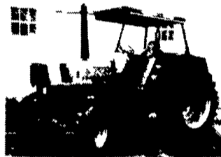
Deutz DX 4.70 90 HP Turbo Diesel, 19.6 GPM Hyd. Pump, 15 Speed All-Synchro Trans., 540/1000 PTO, F. Weights. Unit #225 $19,398