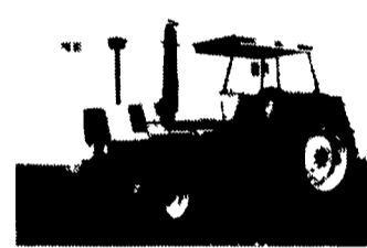
Deutz DX-120 111 HP Diesel, 15 Speed All-Synchro Trans., 24 GPM Tandem Hyd. Pump, 540/1000 PTO, 18.4x38 R. Tires. Unit #219 $20,255