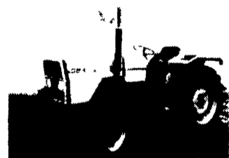
Landini DT 5830 42 HP Perkins Diesel, 12 Speed Synchro Trans., Full FWD, 4 Disc Wet-Type Brakes, 4 Wheel Brakes, Big Front Tires Unit #233 $12,795