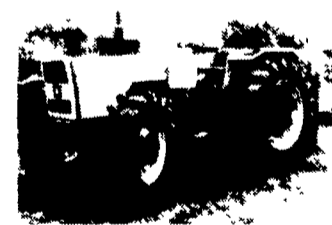
Landini DT8830 68 HP Perkins Diesel, 12 Speed Synchro Trans., Full FWD 5 Disc Wet-Type Brakes, 4 Wheel Brakes, Automatic F. Differential Lock, Big Tires. Unit #243 $16,650

NOTICE: CASH PRICES TILL DECEMBER 31, 1984. All new w/New Factory Warranty. All Actual Photos. 9.9% D.C.C. Financing Available On Deutz