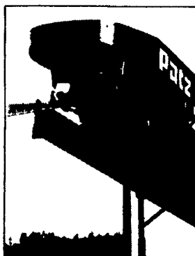
Patz Gutter Cleaner