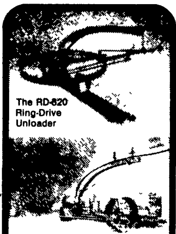
The RD-820 Ring-Drive Unloader

See us today for more information on the Patz way to more reliable gutter cleaner performance.