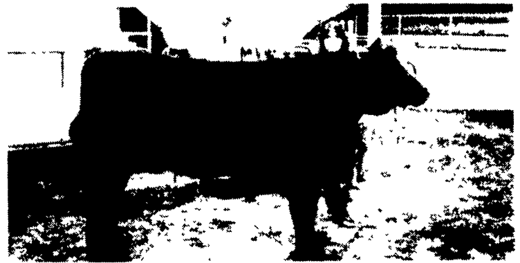
The reserve champion steer was owned by Geraldine Popp.