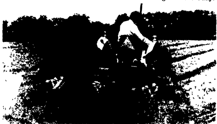
The new Model 158 tedder is one of a pair of new hay tools from Sperry New Holland. The 13-foot working width unit spreads and aerates swaths and windrows to speed curing in limited periods of favorable weather. The Model 162 teds a 17-foot width.

portion cures at more nearly the faster rate of the material near the surface. As a result, curing time is reduced. Grasses that tend to mat down after cutting are especially benefited. Frames of the new tedders are articulated to allow rotor tines to follow ground contours closely without picking up debris or mixing soil into the hay.