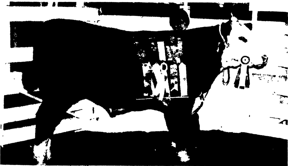
Berks County's grand champion market steer was shown by Greg Zook of Oley. The steer was purchased by D. Stoltzfus Construction Co. of Fleetwood.