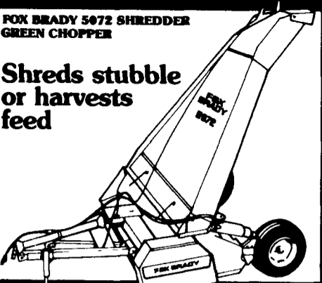
FOX BRADY 5072 SHREDDER GREEN CHOPPER