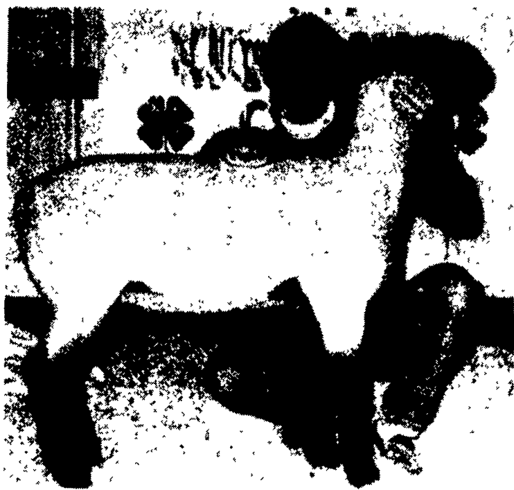
Reserve champion market lamb honors went to Tricia Musser and her 117-pound Hampshire.

The show's market lambs were offered for sale the following afternoon, Nov. 17, during the Southeast District 4-H Beef and Lamb Sale held at the New Holland Sales Stables. Engle Business Equipment, of Elizabethtown, was the top bidder for the grand champion lamb, at $4 per pound. The lamb was then donated back to the sheep club.