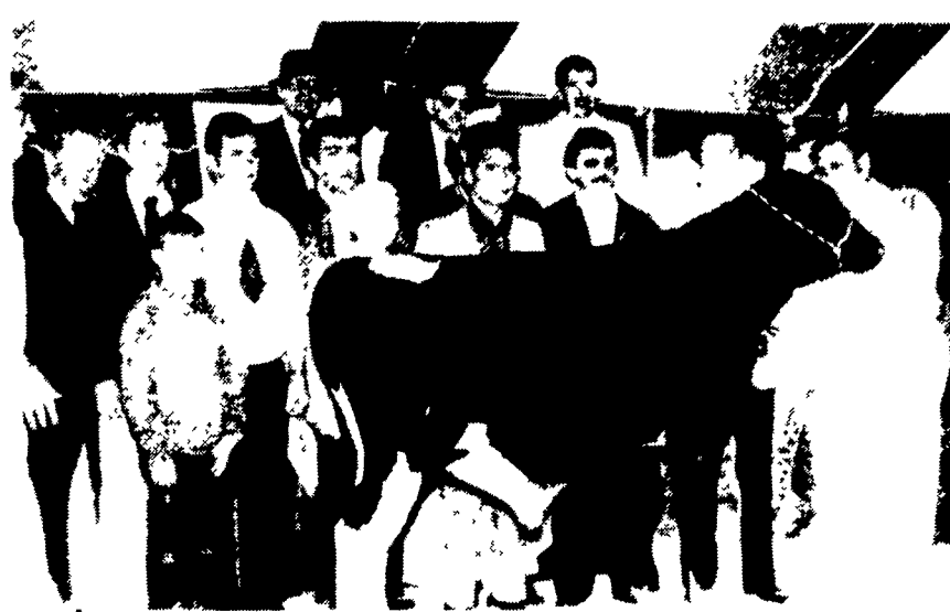
The impressive Poverty-Hollow Margaret-ET brought $59,000 as the second high-selling female of the Rothrock Golden Opportunities Sale.