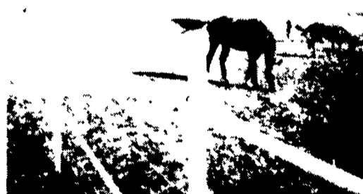
"The Arc 12 Solar system allows us to safely run our stallions next to the mares eliminating time and labor on try backs"

Harold S. Warder, Quality Quarter Horses, Oskaloosa, Iowa