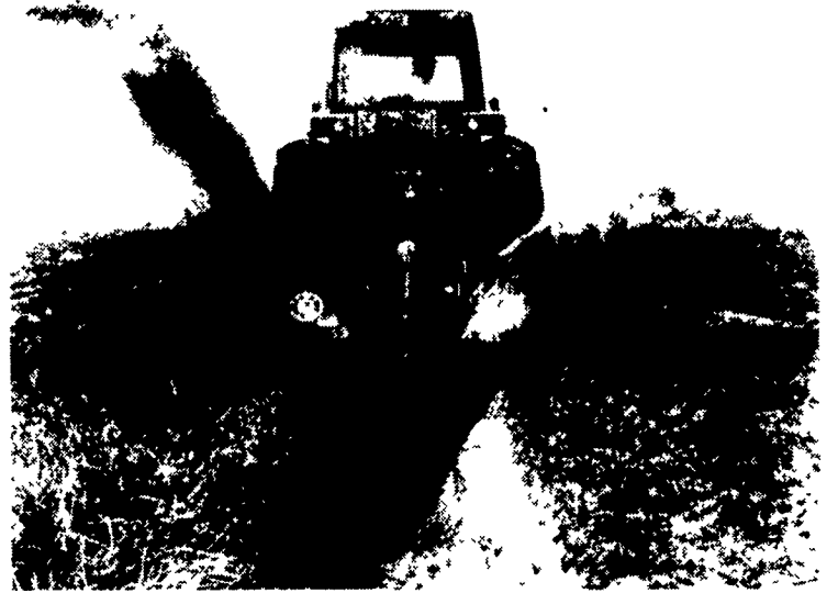
New rotary ditchers are being offered by Bush Hog.

The RD50 series is equipped with two cutting wheels to dig as deep as 50 inches while the single-wheeled RD20 digs 20 inches deep. The RD20 has a 540 RPM gearbox for 50-60 horsepower tractors and can be offset up to 22 inches from the tractor's center line.